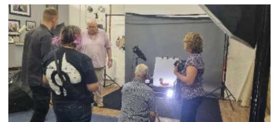
Top: Photography day at The Raptor Centre